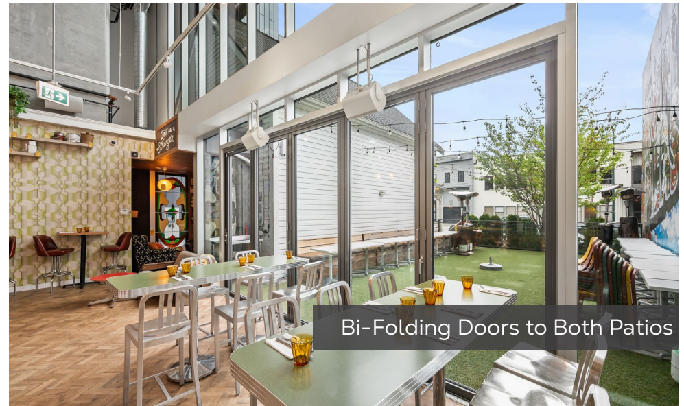
Bi-Folding Doors to Both Patios