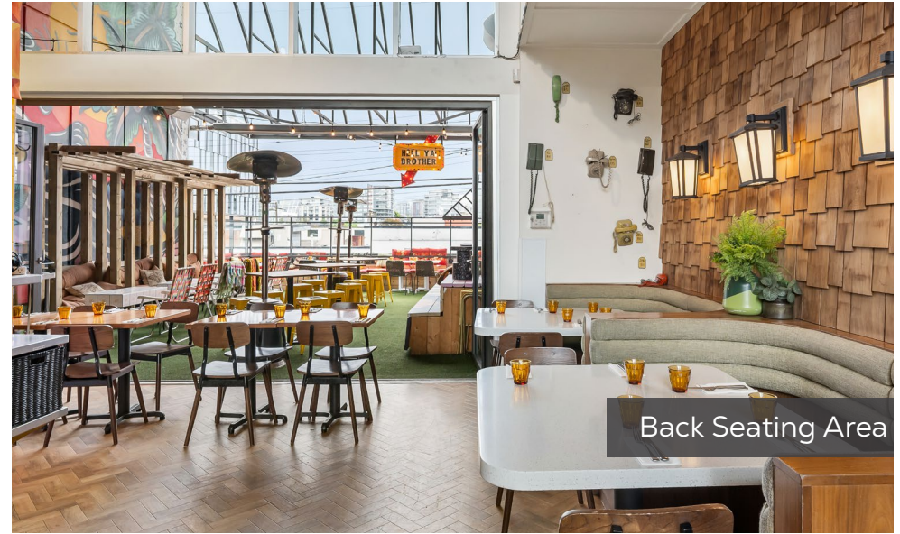
Back Seating Area