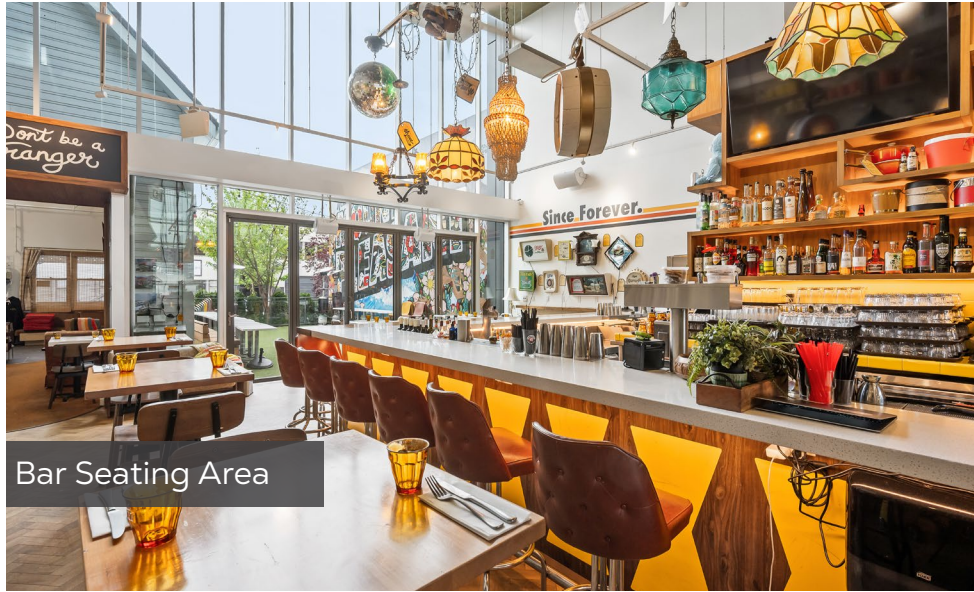
Bar Seating Area