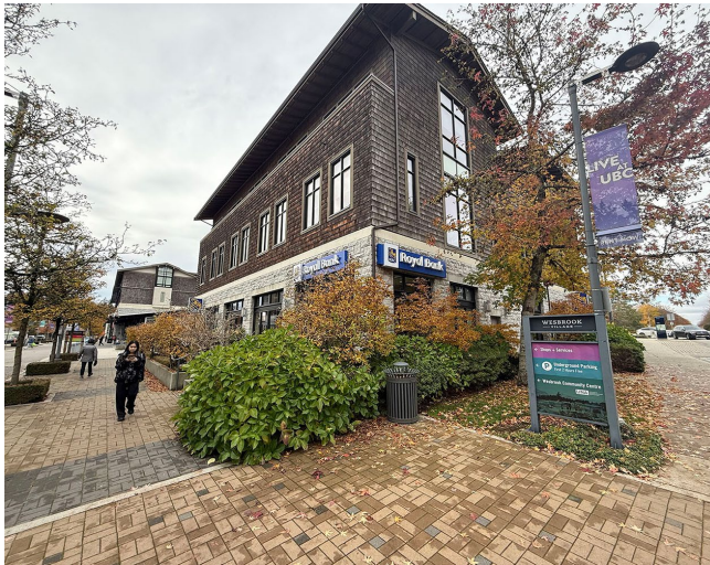
Corner Berton Ave and Wesbrook Mall