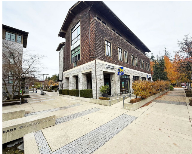
Corner of Burton Ave and Shrum Lane