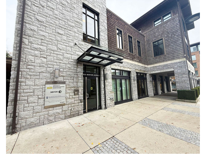
Office Lobby Entrance