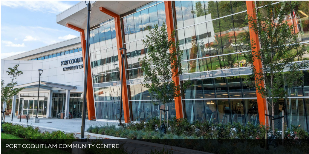
PORT COQUITLAM COMMUNITY CENTRE