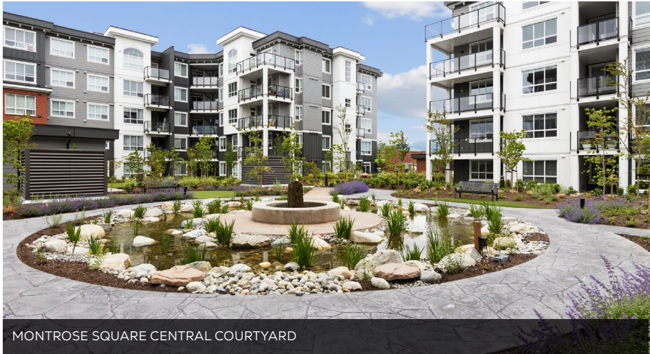
MONTROSE SQUARE CENTRAL COURTYARD