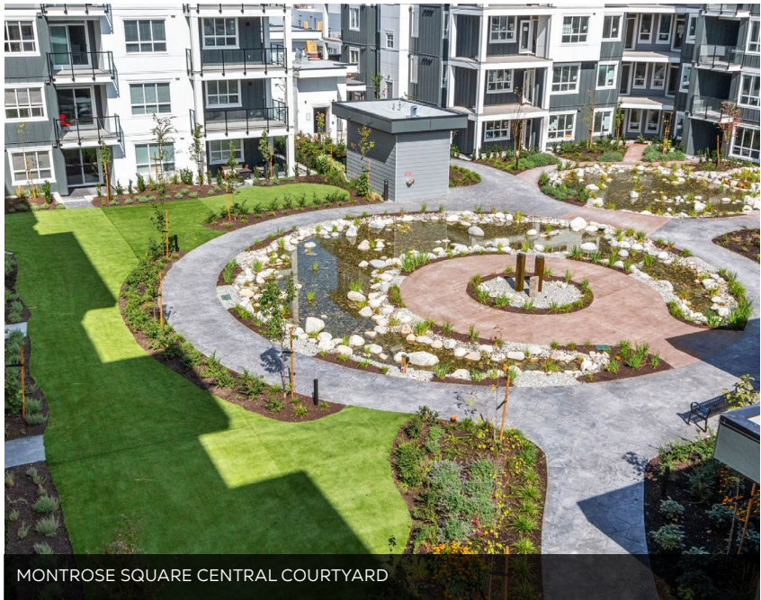
MONTROSE SQUARE CENTRAL COURTYARD