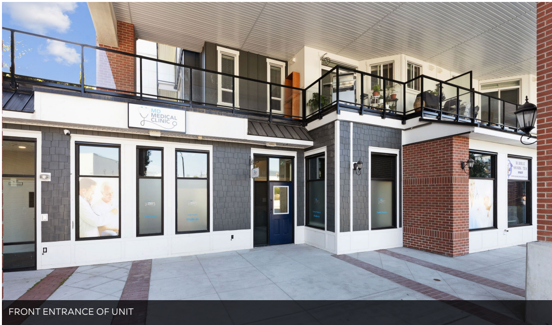
FRONT ENTRANCE OF UNIT