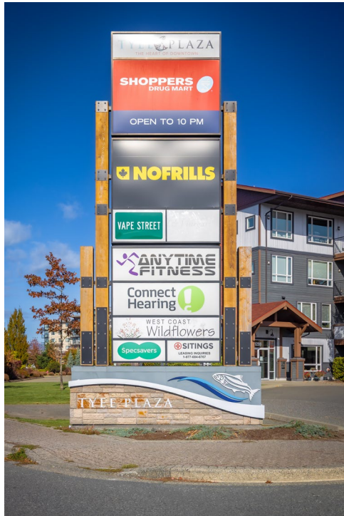
PYLON SHOPPERS ROW