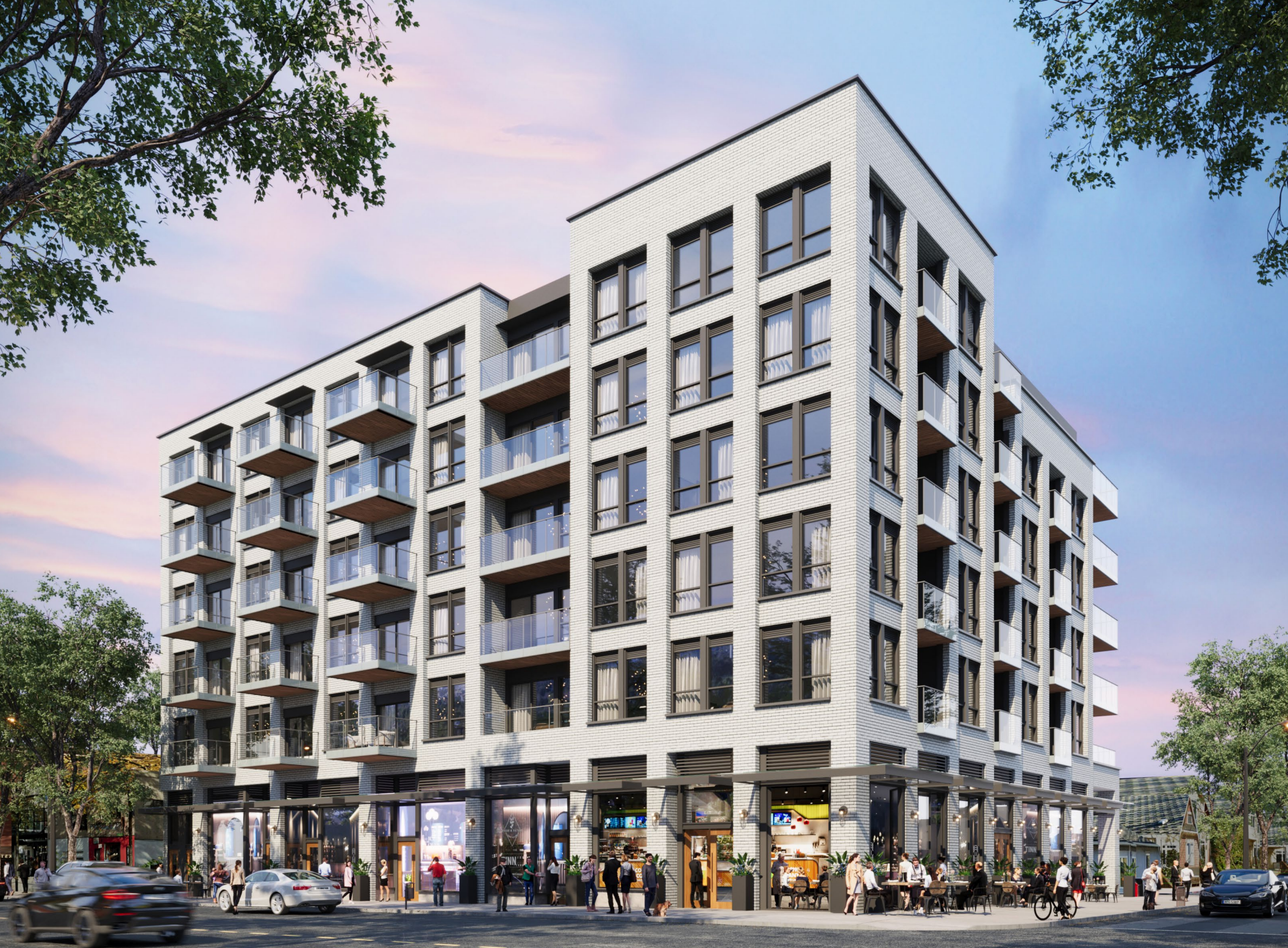
Artist rendition. All renderings/pictures are for illustration purposes only