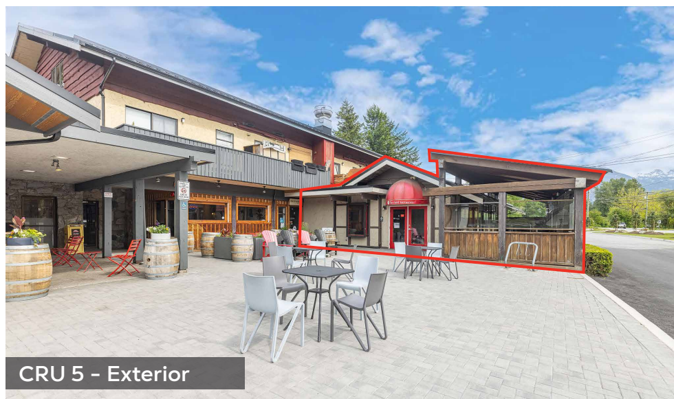
CRU 5 - Exterior