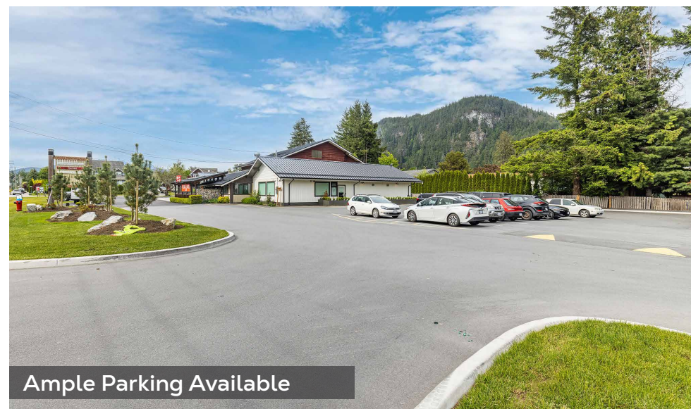
Ample Parking Available