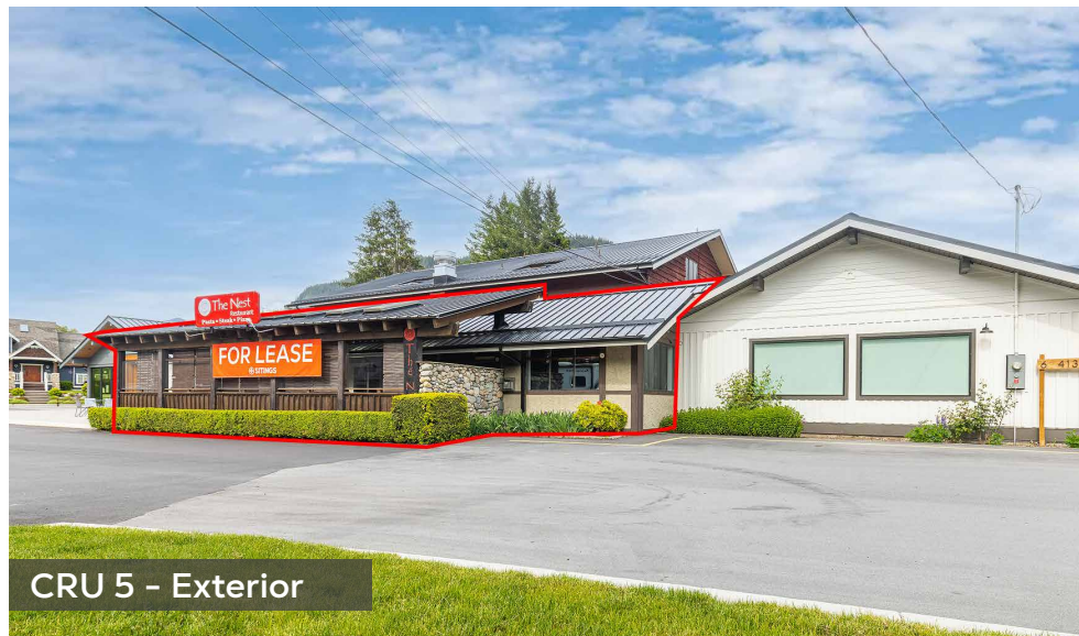
CRU 5 - Exterior