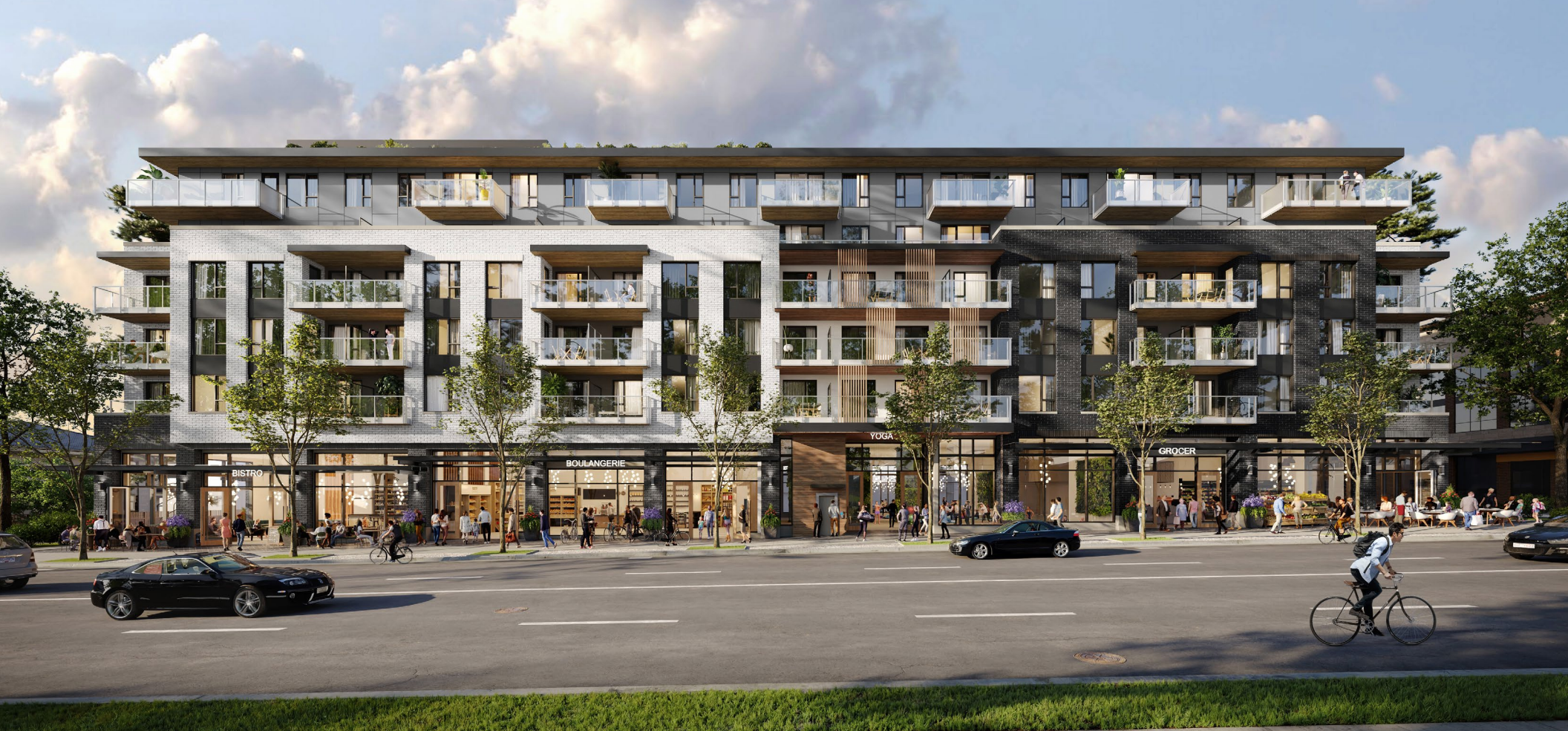
Artist rendition. All renderings/pictures are for illustration purposes only