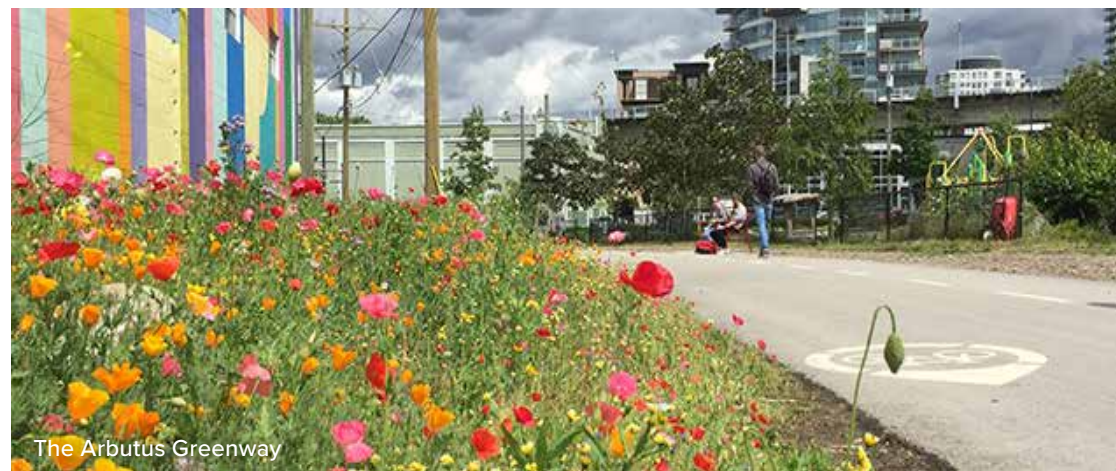
The Arbutus Greenway