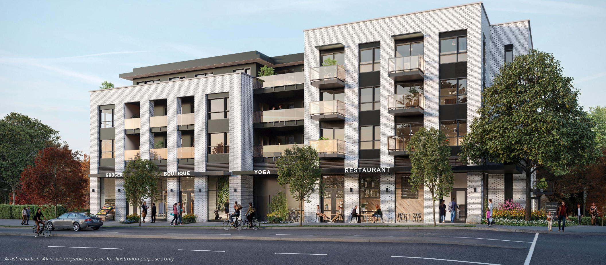
Artist rendition. All renderings/pictures are for illustration purposes only