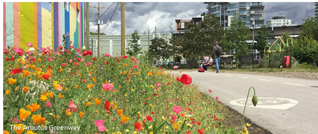
The Arbutus Greenway