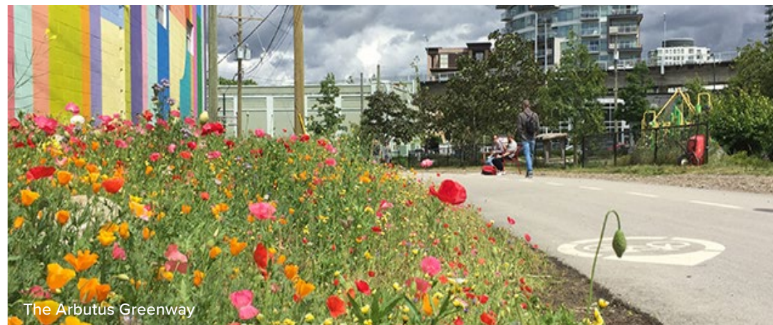
The Arbutus Greenway