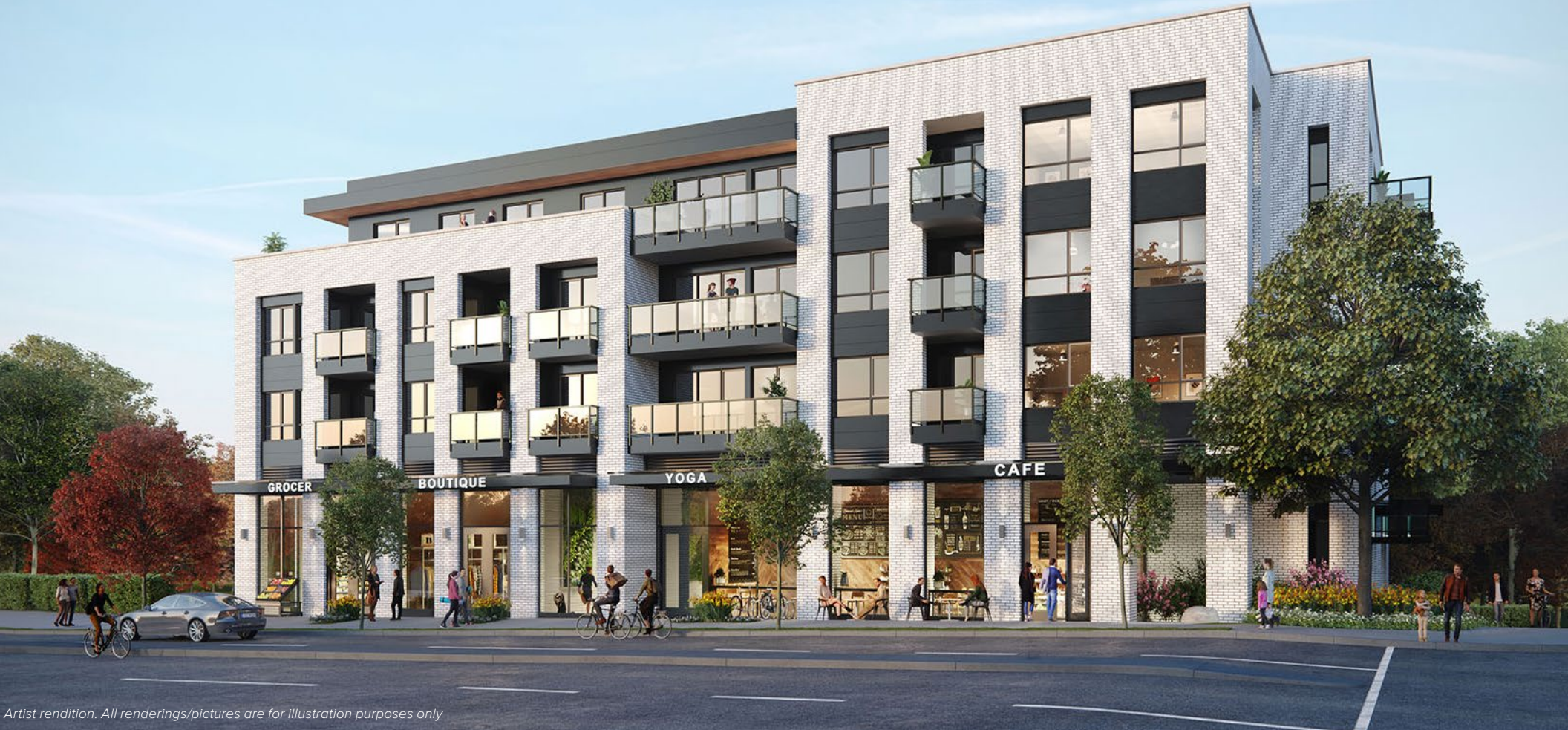
Artist rendition. All renderings/pictures are for illustration purposes only