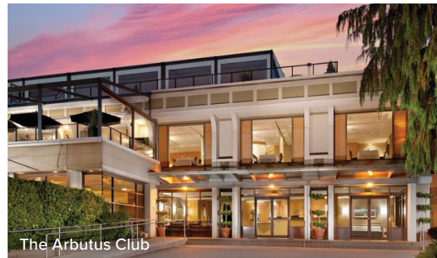
The Arbutus Club