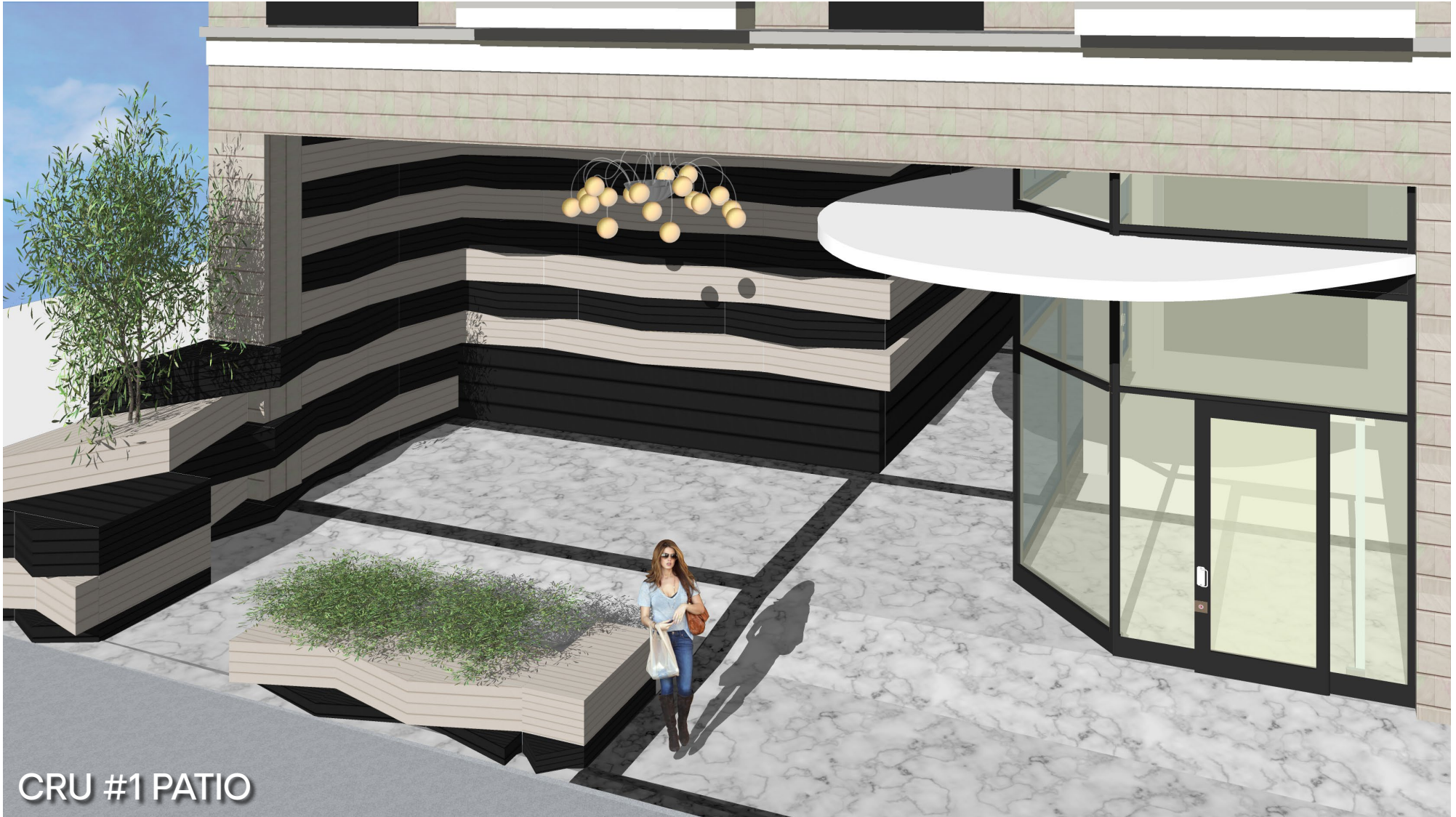
CRU #1 PATIO