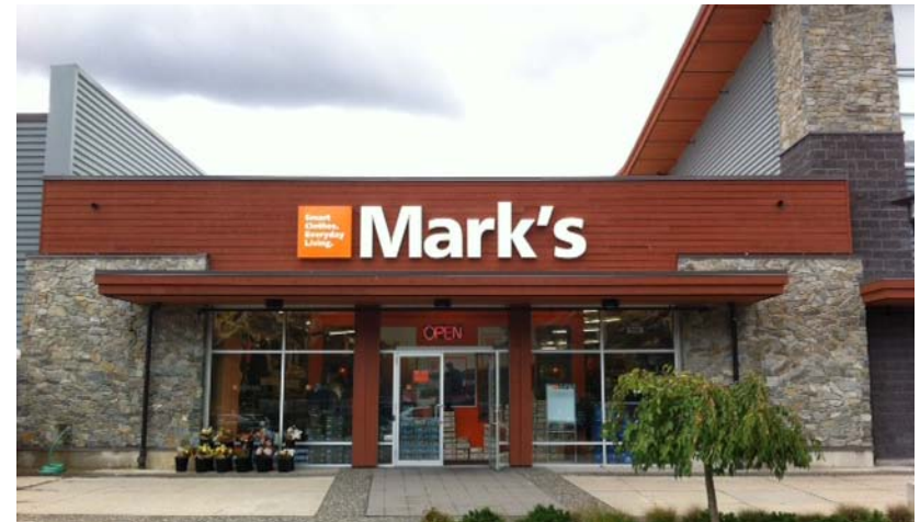
Mark's - 8,655 SF