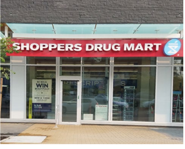
Shoppers Drug Mart