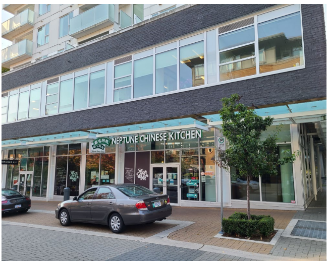
Neptune Chinese Kitchen