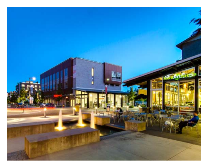
Wesbrook Village North Entrance