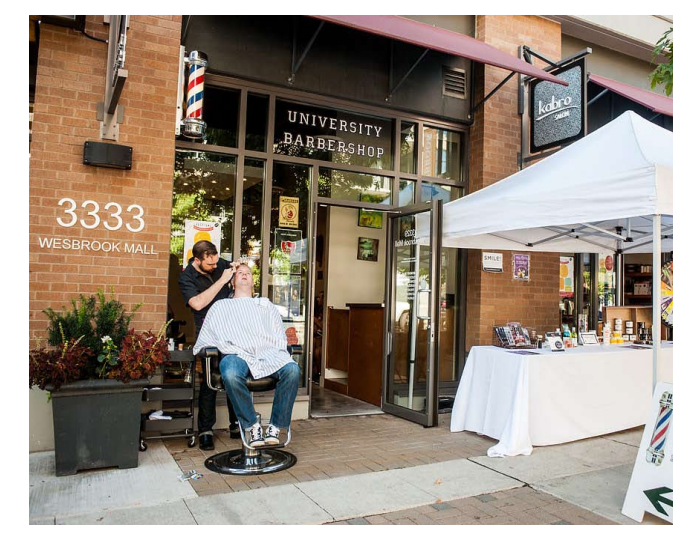
University Barbershop & Kabro Salon