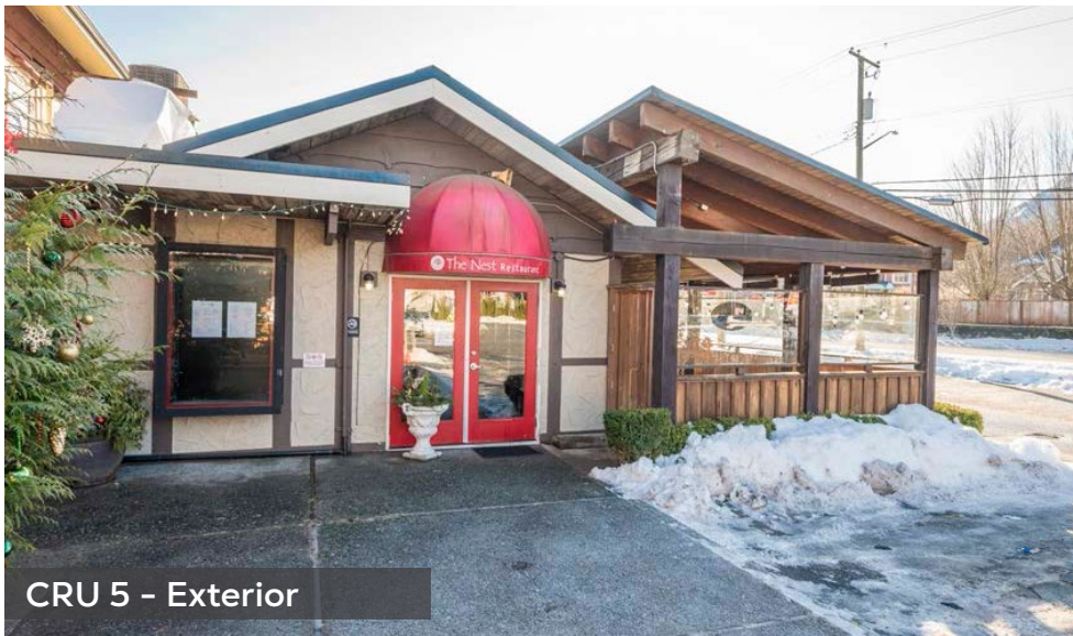
CRU 5 - Exterior