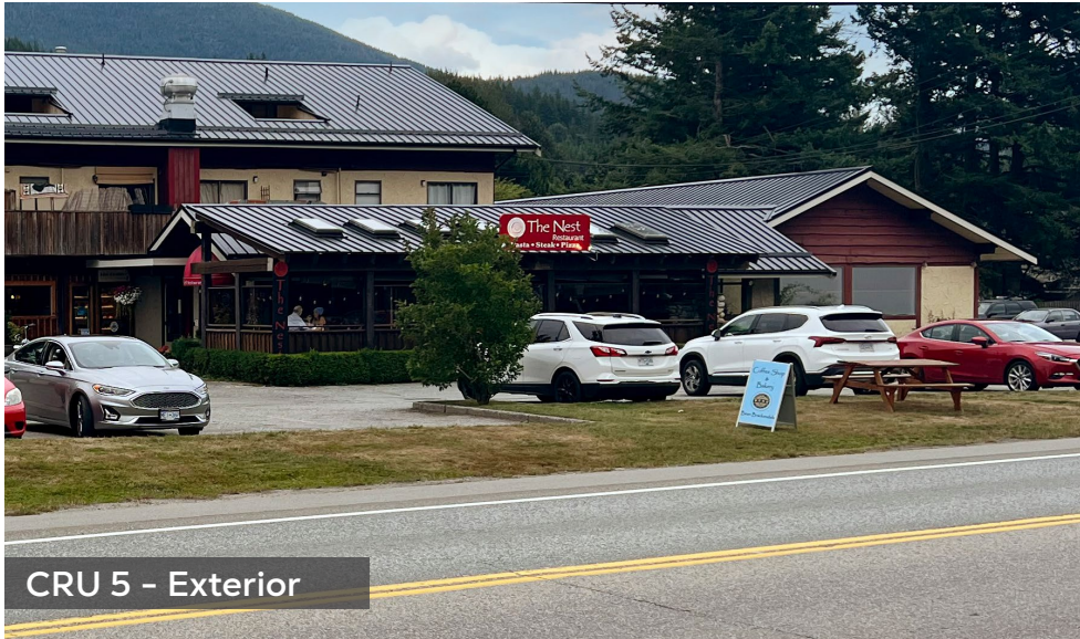
CRU 5 - Exterior