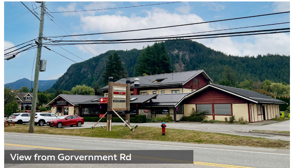
View from Government Rd