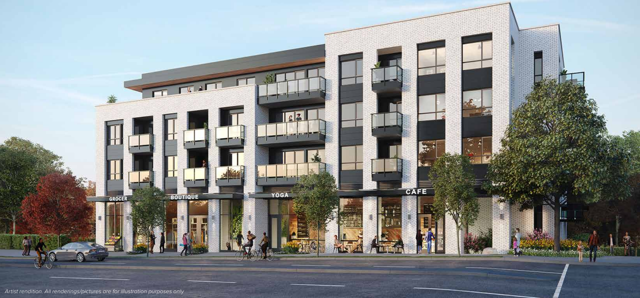
Artist rendition. All renderings/pictures are for illustration purposes only